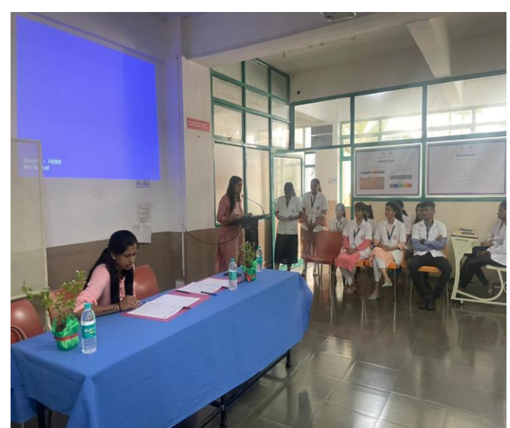
Day 2- Character Day