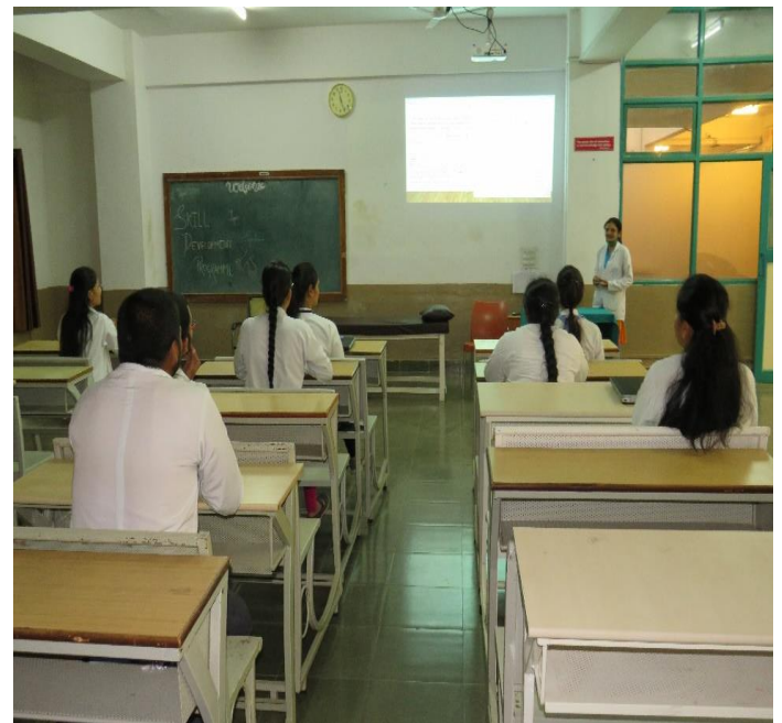
First year BPTH Class room cum Seminar Hall ( Named Margaret Hall) with good ventilation, light and sufficient space and equipped with LCD projector