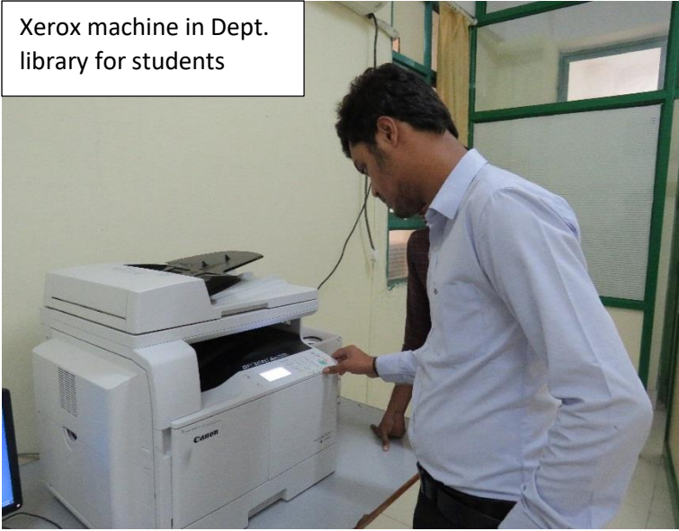
Xerox machine in Dept. library for students