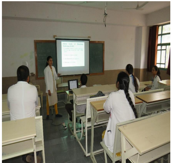
Final year BPTH Class room (Named O'sullivan Hall) with good ventilation, light and sufficient space and equipped with LCD projector

Institution has its own Biometric attendance facility for teaching, non-teaching staff as well as postgraduate students