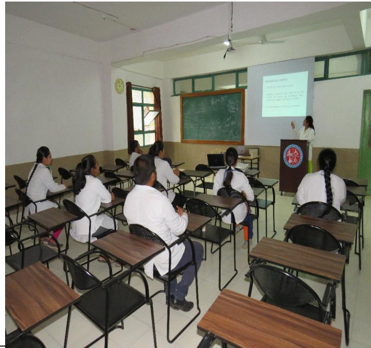
Final year BPTH Class room (Named Magee Hall) with good ventilation, light and sufficient space and equipped with LCD projector