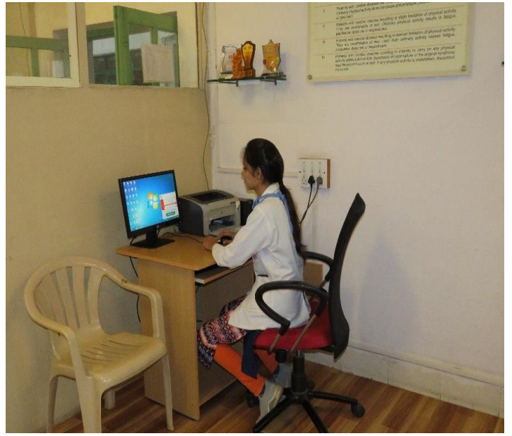
Desktop available in the institute for Teacher and students paper work attached to printer and scanner for efficient working.