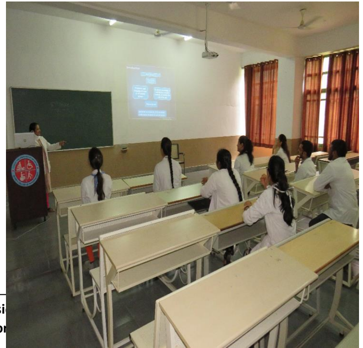
Second year BPTH Class room ( Named Cynthia Hall) with good ventilation, light and sufficient space and equipped with LCD projector