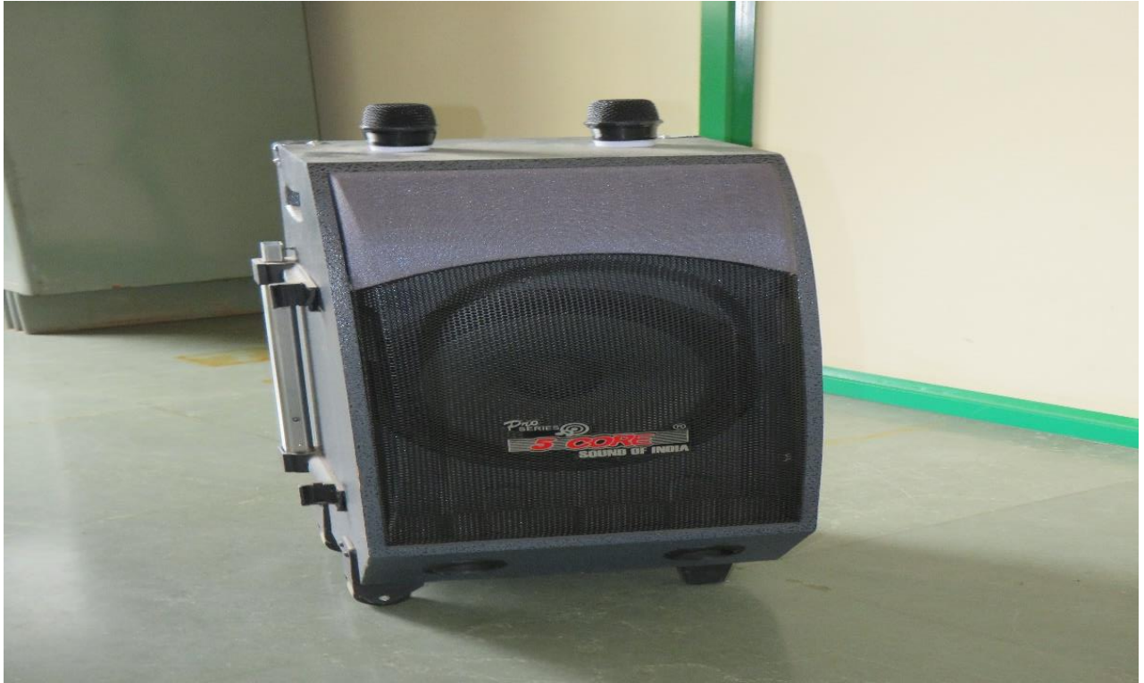
Institute has a separate digital sound system for extracurricular activities for students