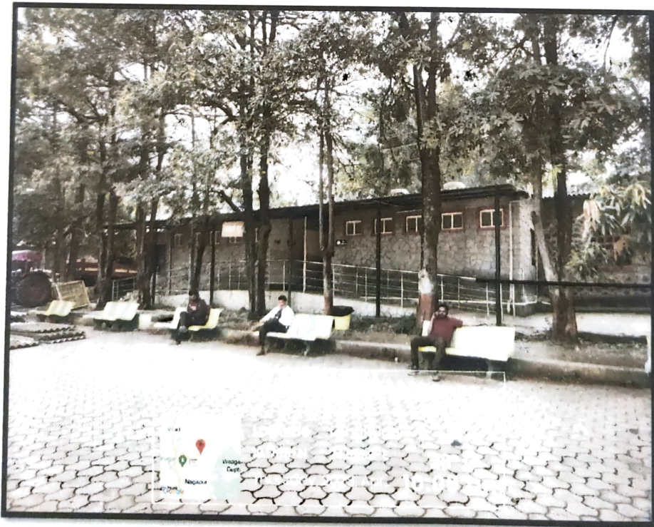
Fig : RAMP WALKWAY AT PHYSIOTHERAPY OPD